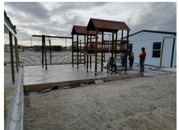
Concrete slab going in for rubberised surface