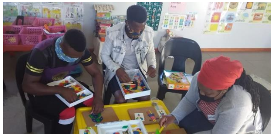
Middle TTinT group = educational games and how to play them