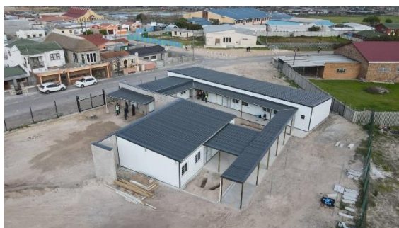
The completed main structure for Lonwabo