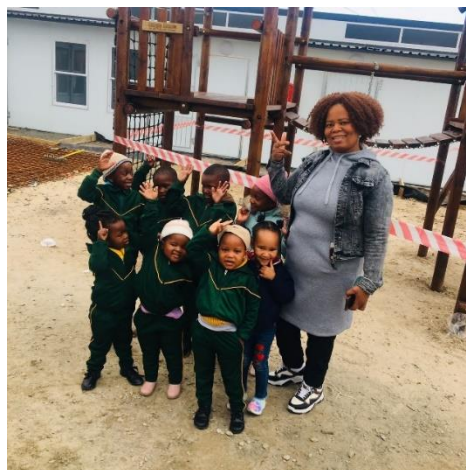
Installation of the jungle gym